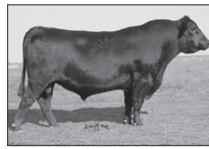
B/R Ambush 28