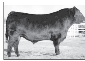
New Design 1407