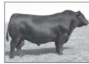
SAV Net Worth 4200