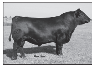
Boyd Next Day 6010