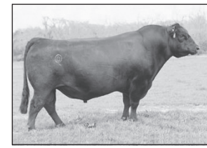
Quaker Hill Objective 3J15